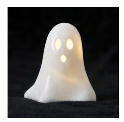
Product Name: Ceramic Light Up LED Ghost

Model: Lights and Lamps Product Code: HB_64323